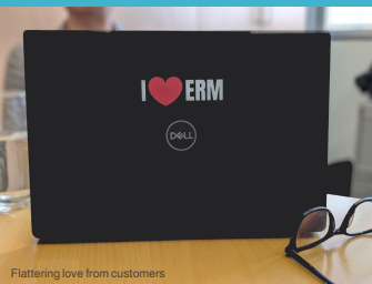
Flattering love from customers

Put simply, we use technology to help researchers be more productive and use fewer materials.