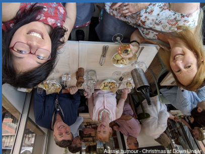
Aussie humour - Christmas at Down Under

We offer generous holidays, private health insurance, reimbursement towards health & fitness membership, a pension or superannuation, breakfasts in the office and beer on a Friday evening.